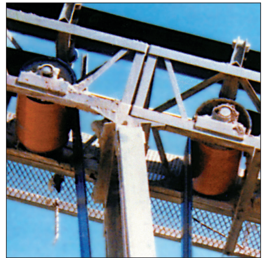
IMTECH ® NDP 45 pulley lagging eliminates material buildup on bend and snub pulleys.

IMTECH ® NDP 60 Lagging is best suited for use on conveyor bend and snub pulleys in high-tension applications. The lagging will eliminate build-up and reduce wear on the pulley